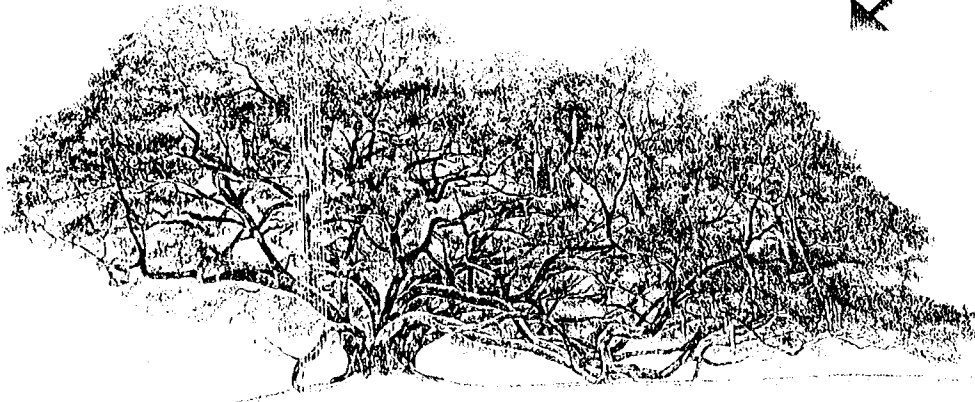
Seven Sisters Oak Tree - Lewisburg

© STEPHEN MALCOFF to order this print go to: www.orbucospr.com