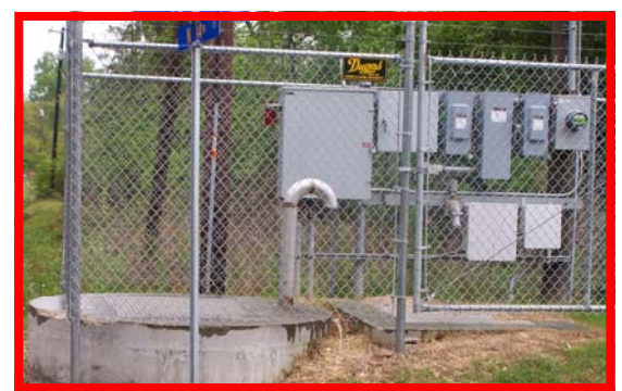
The construction of a sewer collection system for approximately 80 residents.