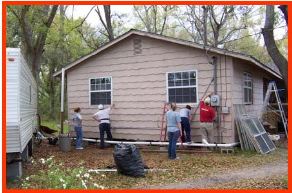
Installation of cost-effective measures to reduce home energy consumption.